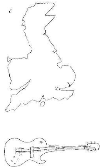
FIG. 1 Examples of C.K.'s performance on various tasks. a , Example of C.K.'s copying of geometric configurations. The numbers indicate the sequential order of the strokes. b , C.K.'s copying (middle) and spontaneous writing (bottom) of a target sentence (top). Note the difference between the copied letter 'a' which is identical to that in the target stimulus and the letter 'a' produced in spontaneous writing to dictation. c , Examples of C.K.'s spontaneous drawings of items from memory: a map of England with 'X' marking his birthplace and an electric guitar.

Pack my box with five dozen jugs of liquid veneer.